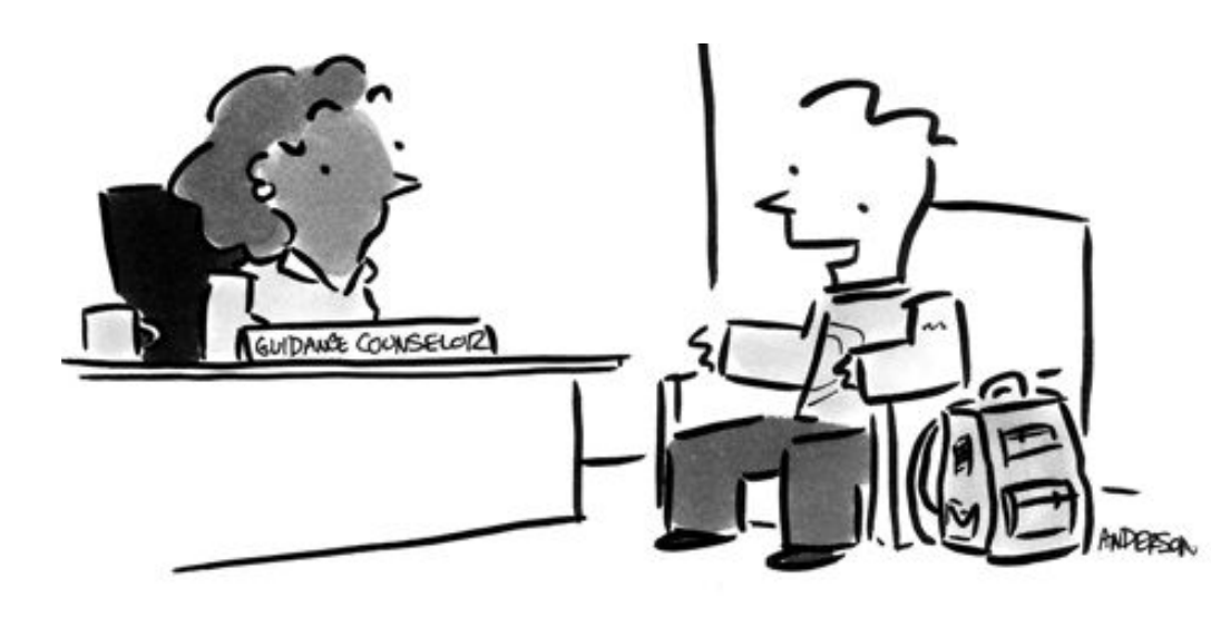
"I want to show my colleges I'm well-rounded, so I wrote a poem in Spanish about how chess club has made me a better quarterback."